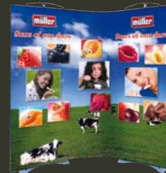
Double twist with flexi link £829