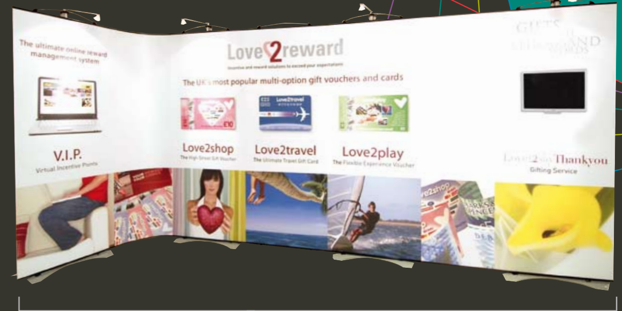
7 panel twist system with media unit £1,795 (excludes TFT monitor)