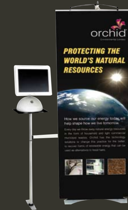
Single twist with computer extension £434